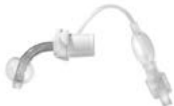
REF 372 with H 2 O Cuff