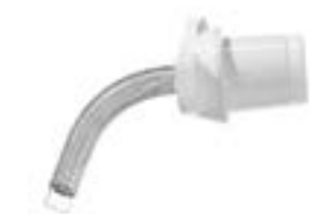
REF 370 without H 2 O Cuff