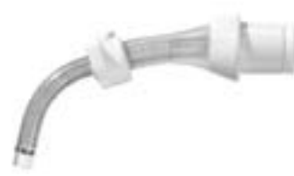
REF 371 without H 2 O Cuff, proximal longer