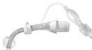
REF 373 with H 2 O Cuff, proximal longer

Standard tubes and length variants (C-Variants) for REF 370 / REF 371 / REF 372 / REF 373